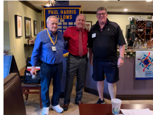
Rotarians at Work

Today's Song: "Yankee Doodle" (see back)