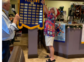
Rotarians at Work

Today's Song: "Yankee Doodle" (see back)