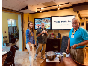
Rotarians at Work

Today's Song/Poem/Quote: "Volunteers" (see back)