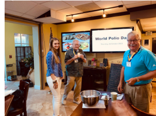
Rotarians at Work