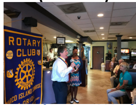
Rotarians at Work

Today's Song/Poem/Quote: "Life of Service" (see back)