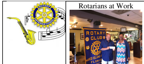
Keep Your Eye on the Money...

Today's Song: "Speakin' O' Rotary" (see the next page)