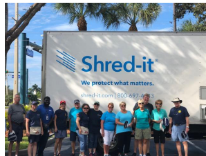
Rotarians at Work